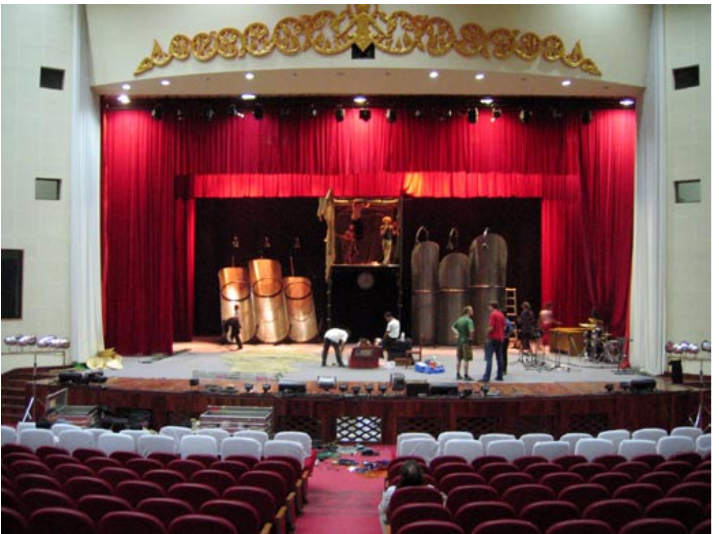
Aufbau in der Culture Hall