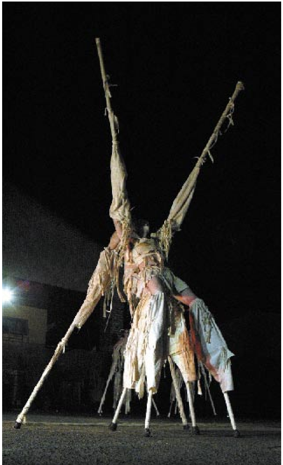
antagon theaterAKTion

They create an international language that touches audiences on an emotional level.