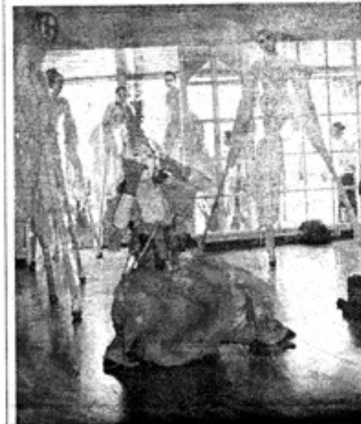
Antagon artists put on a sample display at the Novotel.

The show will be of great interest for local people as it will be like nothing that has been staged here before. Tickets are on sale at US$4, US$6 and US$10 at Sayo Magazine, Sunlabob, Novotel and other outlets in Vientiane.