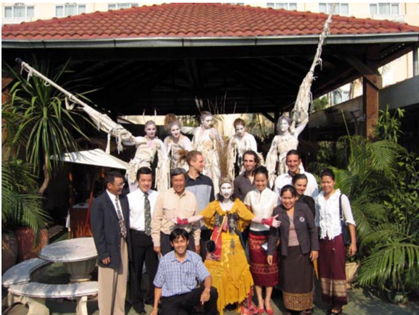
Foto für die Presse mit Medienpartner und Sponsoren