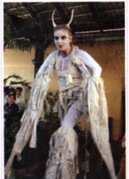
German artists will perform next week. -See story page 3