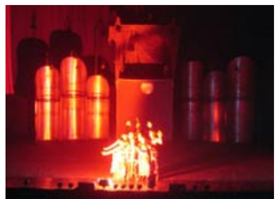
Time Out Auftritte in der Vientiane Culture Hall