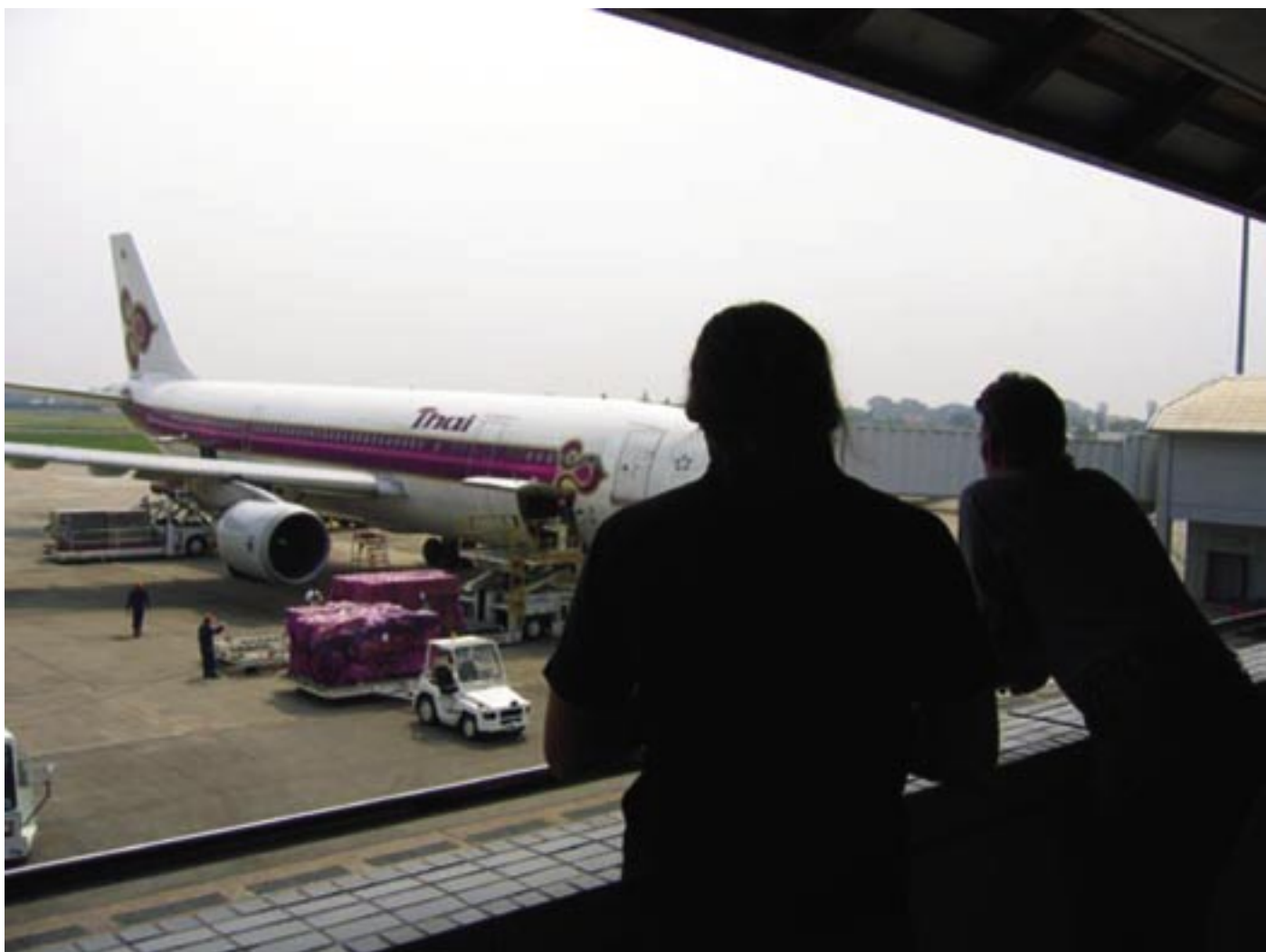
Einreise in Laos via Bangkok