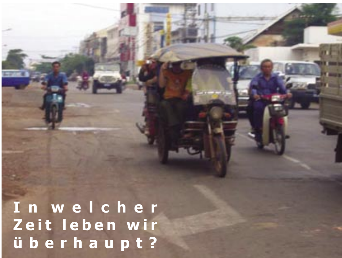
Mit dem Tuk-Tuk unterwegs in Vientiane