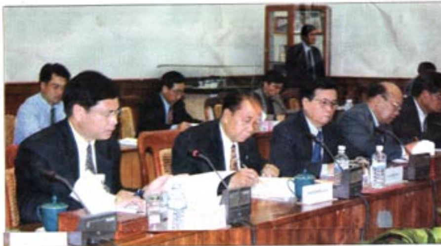
Government members summarise the implementation of the work plan for the month of April.

The two-day meeting, beginning on April 20, discussed the implementation of the development plan and the budget plan for the third quarter of fiscal year 2004-05, and the boosting of crop production in the dry season. Production has covered 74,730 ha, while poultry and fish