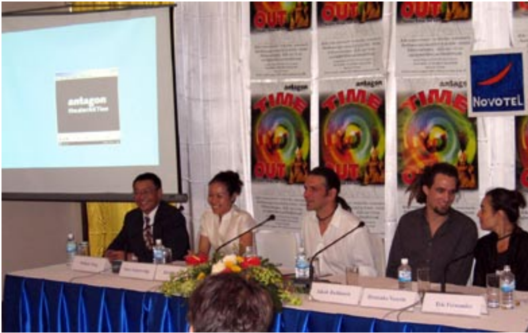
Press conference in Novotel