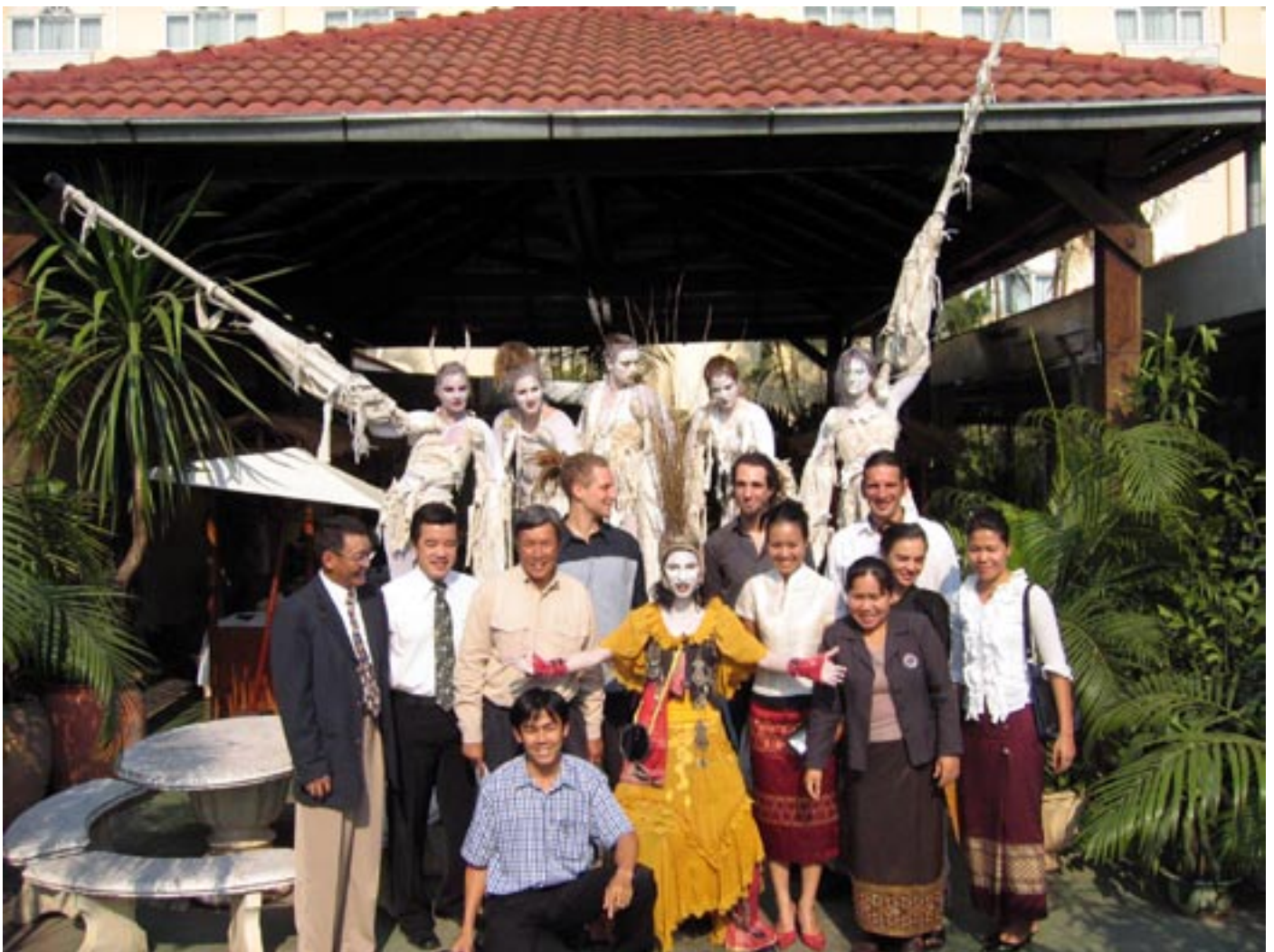
Photo for the press with media partners and sponsors