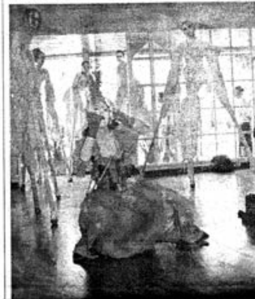
Antagon artists put on a sample display at the Novotel.

The show will be of great interest for local people as it will be like nothing that has been staged here before. Tickets are on sale at US$4, US$6 and US$10 at Sayo Magazine, Sunlabob, Novotel and other outlets in Vientiane.