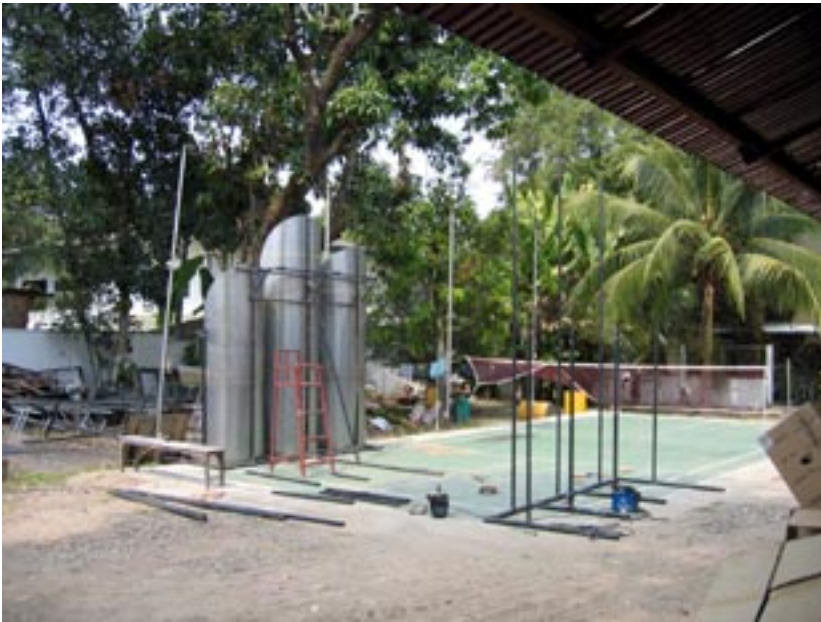
Construction of the stage scenery by our sponsor Sunlabob