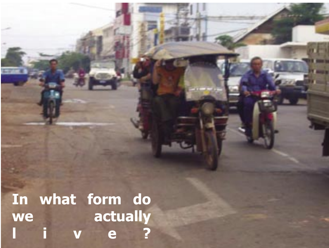
With the Tuk-Tuk underway in Vientiane