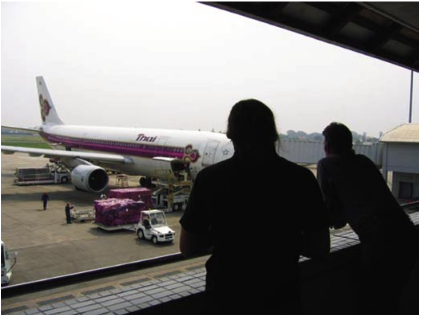
Arrival in Laos via Bangkok